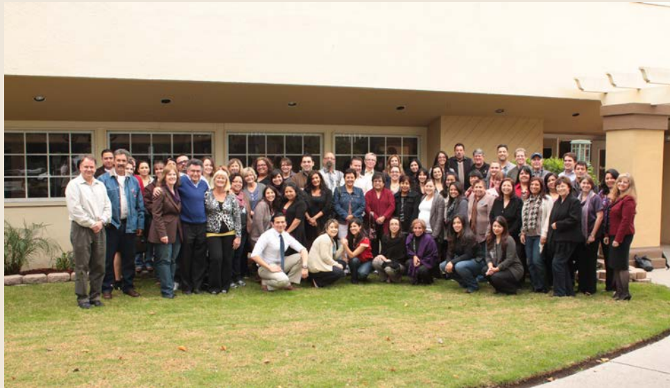
Staff photo taken December 2010

*VCCDC is the Ventura County Community Development Corporation, a non-profit lending subsidiary of CEDC.